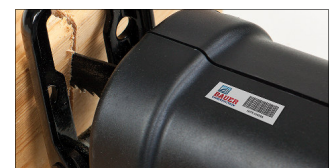
Universal Micro RFID Tag