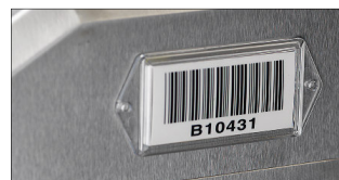
Universal RFID Hard Tag