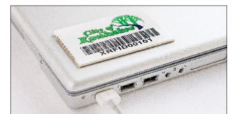
EU Universal RFID Asset Tag