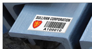
Universal RFID Asset Tag