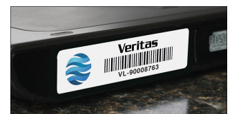
EU Universal Mini RFID Tag