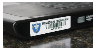
Universal Mini RFID Tag