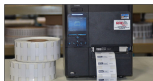
Onsite Printable Universal Mini RFID Tag