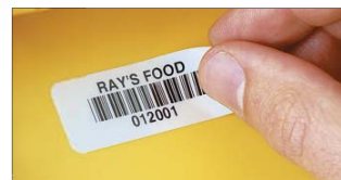
EZ Peel Removable Barcode Labels