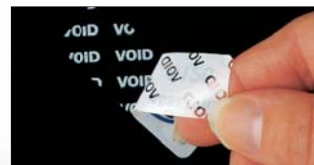
Tamper-Evident Barcode Labels