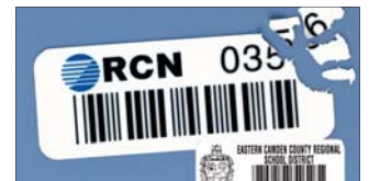
Destructible Barcode Labels