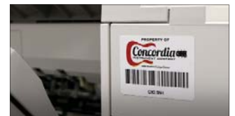
Thermalmark Thermal Transfer Printable Labels