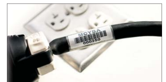
Barcode Cable Label